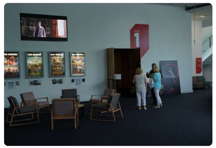
You could see a movie at HOTA Cinema. You can find out what's on here.