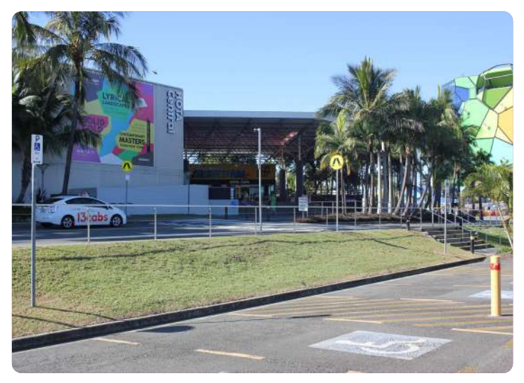
Accessible parking at HOTA Central

Visit our website to find out more information: hota.com.au