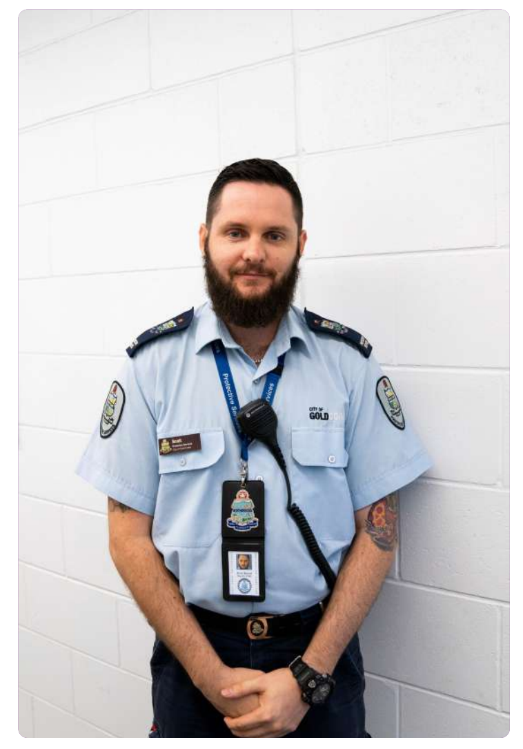
Protective Services Officer