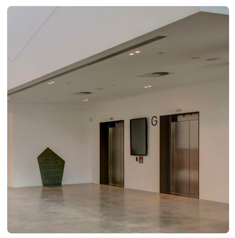
You can use the lifts