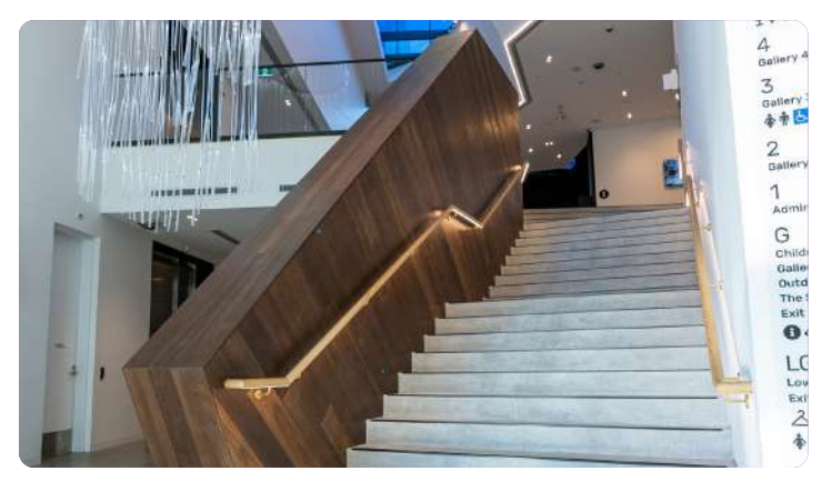
Stairs to Gallery foyer

You need to wave your hand in front of the sensor to open this door.