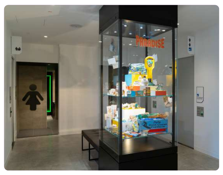
Accessible Toilet and Adult Change Facility