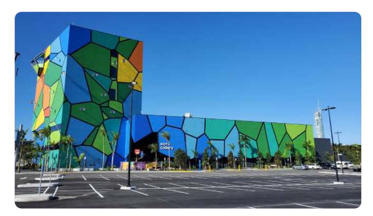
HOTA Gallery Car park