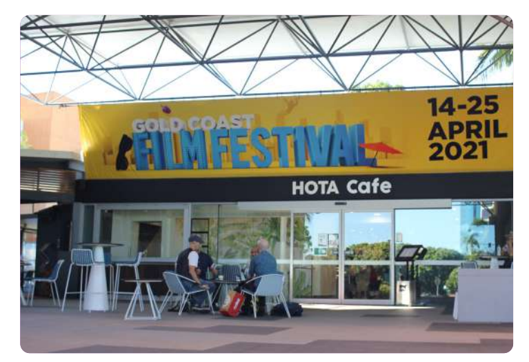
You can visit the HOTA Café at HOTA Central for drinks and snacks. You can see the menu here.

You can buy tickets from the Box Office at HOTA Central or online. You can find out what's on here.