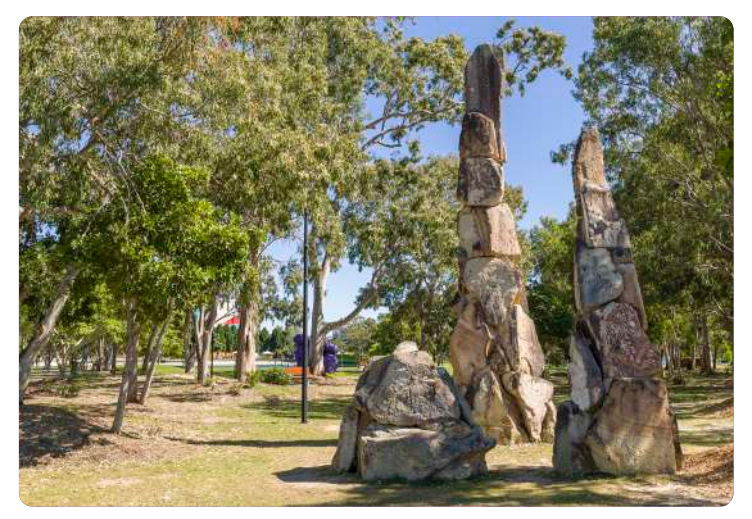
You can look at outdoor art and sculptures in the Parklands.