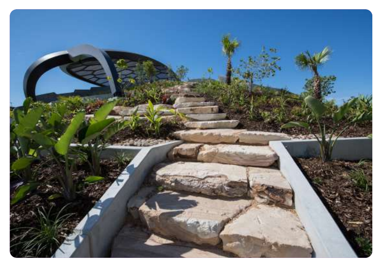
There is an adventure trail you can climb.