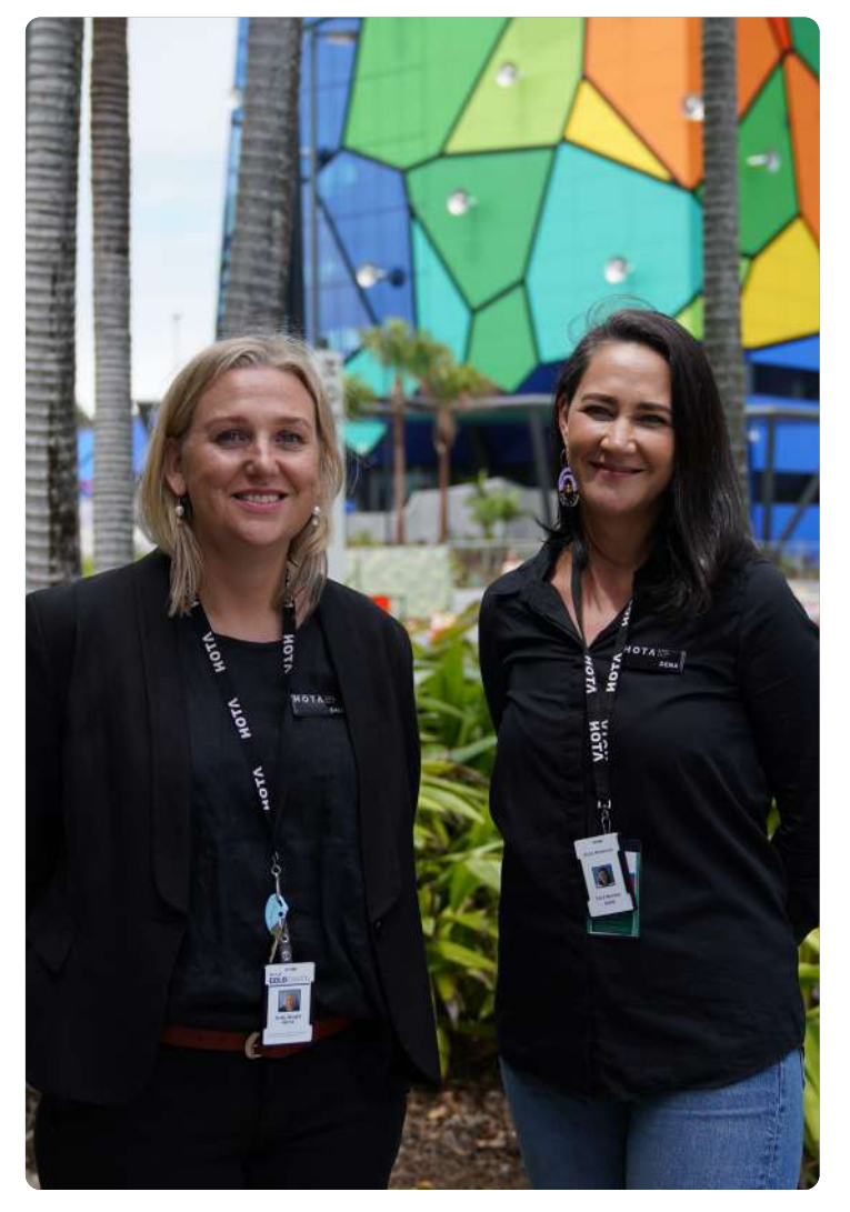
HOTA Gallery staff