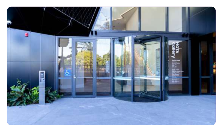
Accessible entrance at lower ground