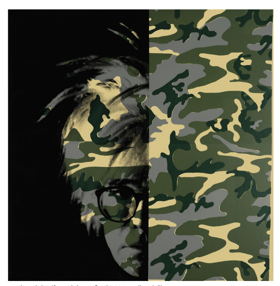
- Andy Warhol, Self Portrait (Camouflage ), 1986. Acrylic and silkscreen on canvas.