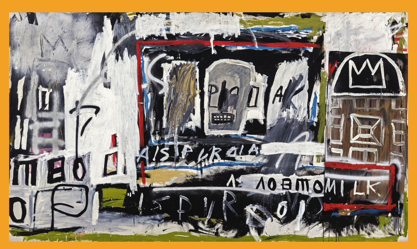
– Jean-Michel Basquiat, New York , New York , 1981. Acrylic, oil stick, spray paint, and paper on canvas.