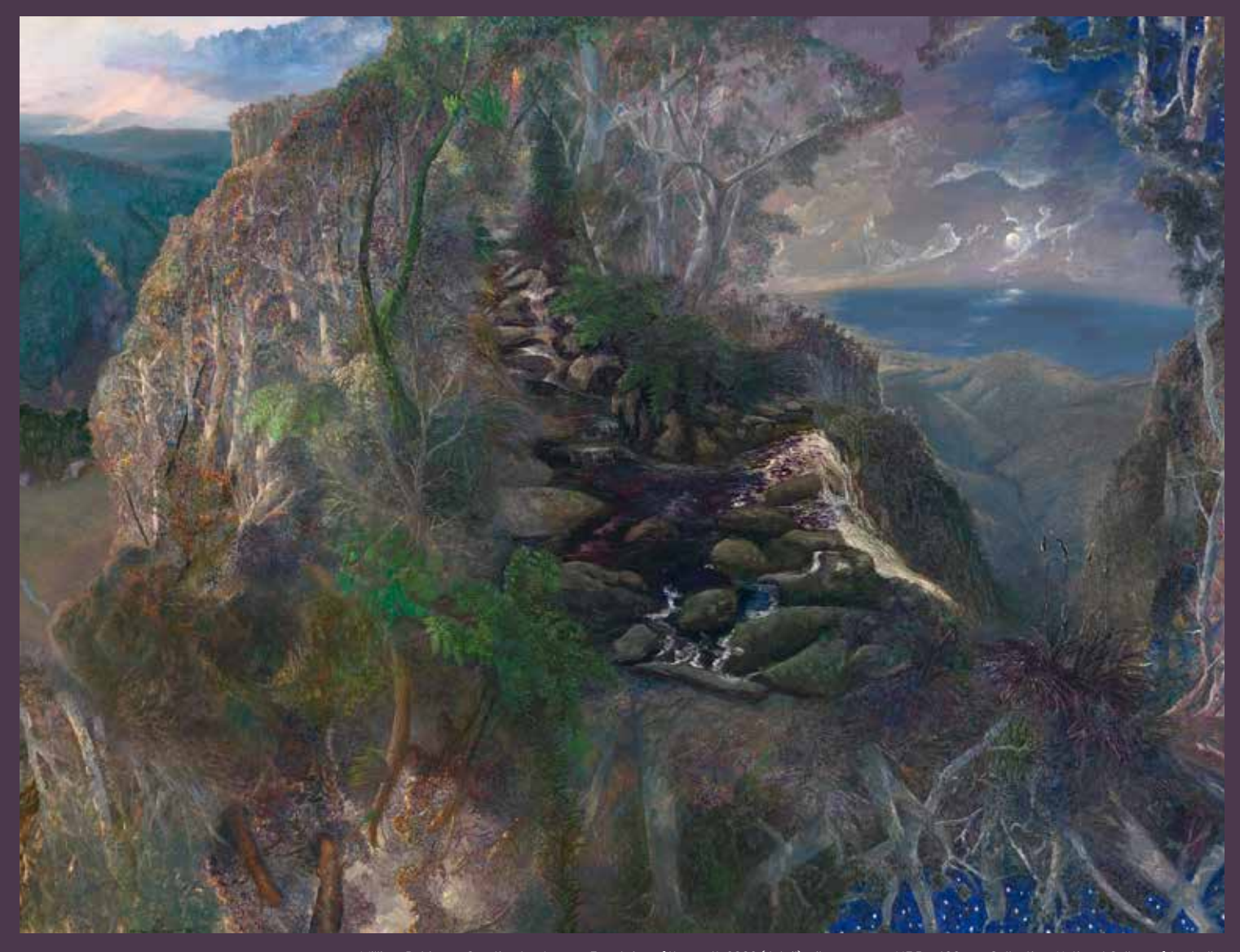
William Robinson Creation landscape: Fountains of the earth 2002 (detail), oil on canvas, 167.5 x 488 cm. Collection: National Gallery of Australia, Canberra. Acquired with the assistance of the Masterpieces for the Nation Fund 2003. © Courtesy the artist and Philip Bacon Galleries, Brisbane.