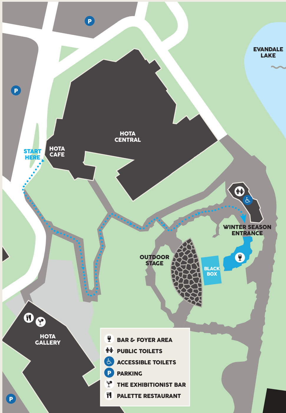
Winter Season is an accessible performance series. For accessible seats Ph: (07) 5588 4000